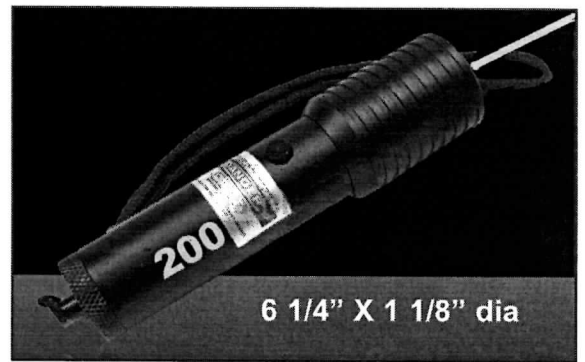
6 1/4" X 1 1/8" dia

At dawn, dusk or night you can see the powerful beam as it leaves the laser...making it easy to aim no matter how far away the birds are